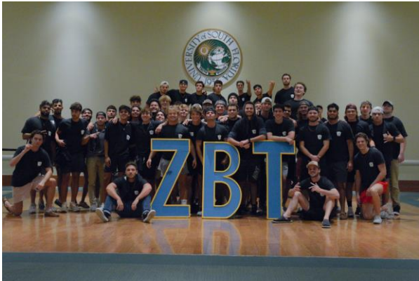
The above photo was taken at the new member class', Alpha Kappa, Bid Rally in the Marshall Student Center Ballroom.